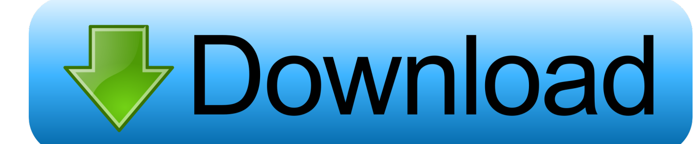
Revit Live 2015 Portable Cracked YHaz Rar